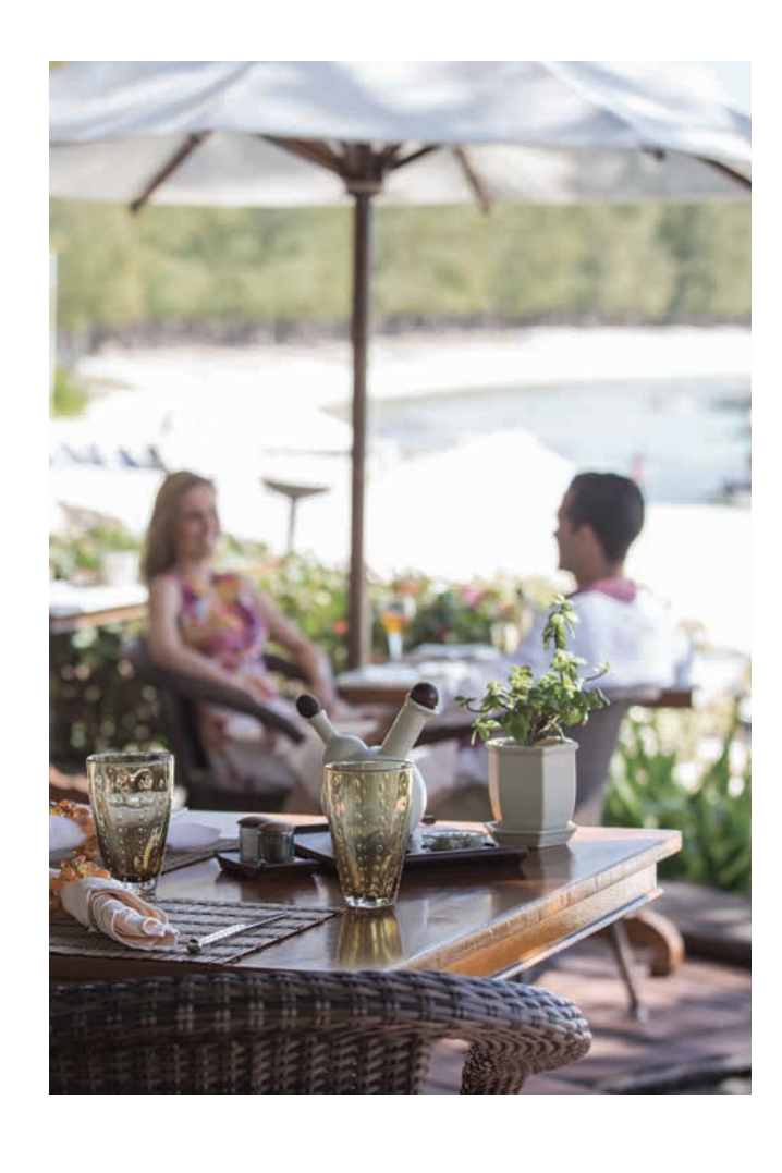
Culinary ties that bind -

In Mauritius, many cuisines fuse on a single plate. French, Indian, Chinese and Creole meet in an explosion of flavours that is unique to the island. Savour this mosaic of cuisines in the most authentic and delicious way with The Residence's virtuoso chefs.