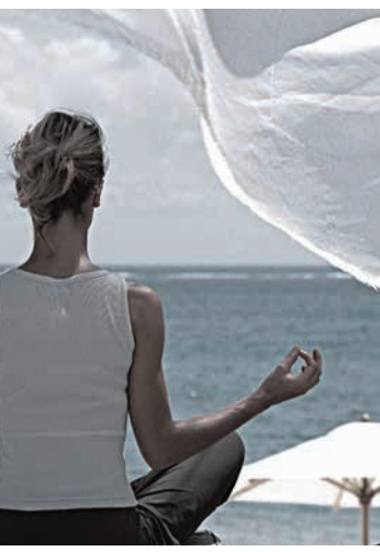
- Boundless island energy –

The lush jungle reveals the soul of the island; an untamed garden of Eden. Nature's wonder is everywhere, from coast to cliff, plains to peaks. Taste the elements riding horseback, trekking through unspoiled terrain or kitesurfing the playful waves.