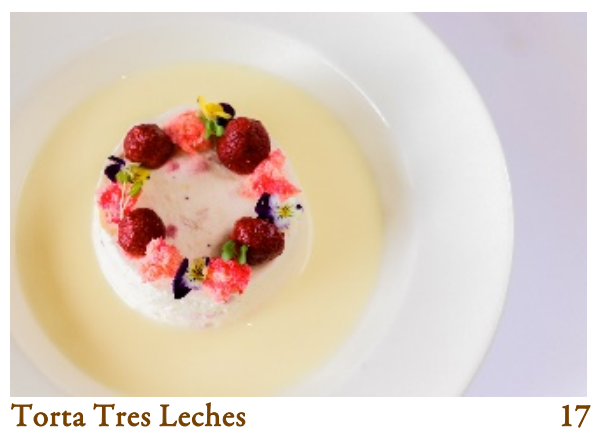
Vanilla Strawberry Cream, Sponge, Fresh Berries