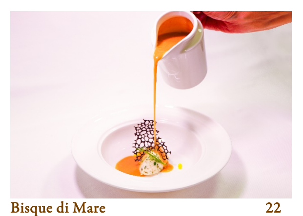
Creamy Seafood Essence, Prawn Quenelle, Squid Ink Tuile, Basil Oil Trickle, Fresh Herbs