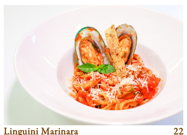
Linguini Marinara Tomato & Fresh Seafood, Parmesan Cheese, Basil Oil Trickle, Fresh Basil