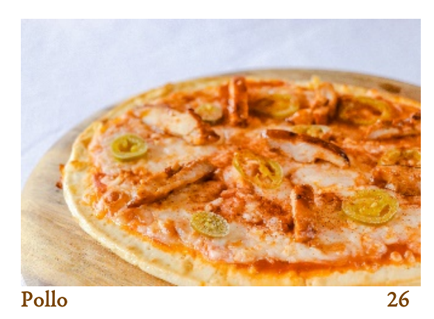
Barbeque Chicken, Smoked Paprika, Jalapenos