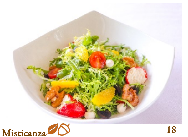
Assorted Greens, Cherry Tomatoes, Goat Cheese, Piquollo Peppers, Fresh Orange, Walnuts, Artichoke Hearts, Balsamic & Orange Dressing