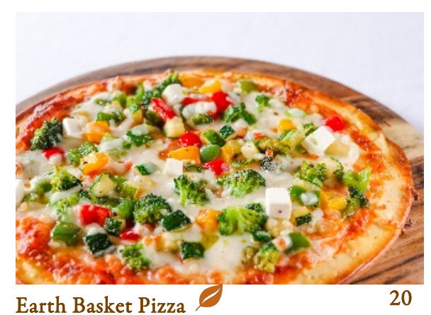
Savor the taste of nature's finest in every bite, and experience the true essence of a pizza made with assortment of Tomato, Mozzarella Cheese, Eggplant, Paprika, Basil, Peppers, Pesto Sauce, Asian Pigeonwings harvested from our "Earth Basket