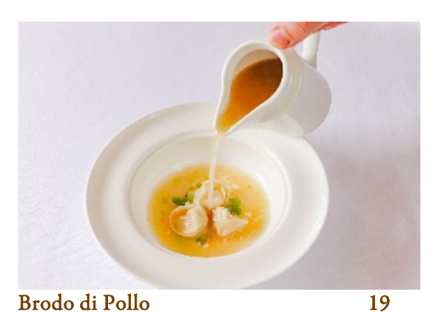
Healthy Chicken Broth, Chicken Tortellini, Basil Oil Trickle, Fresh Herbs