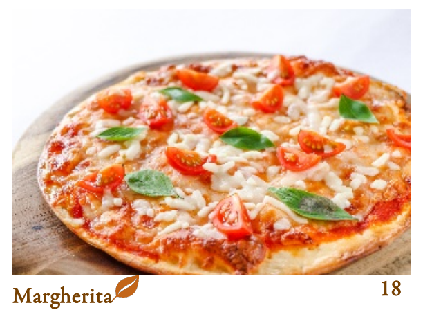
Tomato Sauce, Fresh Basil, Mozzarella