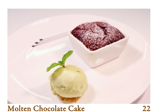
Avocado Ice Cream, Cardamom Crumble