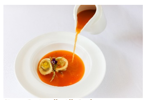
Zuppa Di Agnello Alla Pugliese 19 Ground Herbs, Pulled Roast Lamb & Ricotta Cheese Tortellini, Basil Oil Trickle