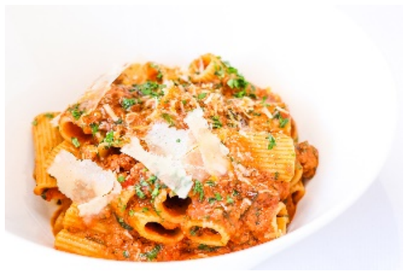
Rigatoni Bolognese 24 Beef & Tomato, Beef Jus, Basil Oil Trickle, Parmesan Cheese, Fresh Basil