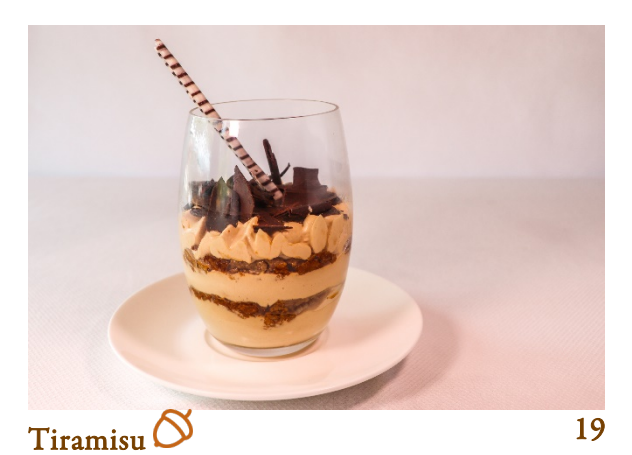
Coffee Chantilly, Kahlúa Liqueur