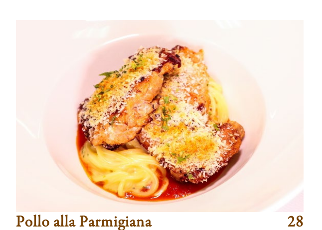
Oven-Baked Parmesan Chicken, Spaghetti Queso, Marinara Sauce