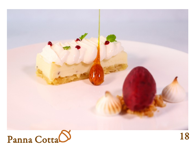
Mixed Berries Sorbet, Almond Nougat, Truffle Cream, Almond Sponge