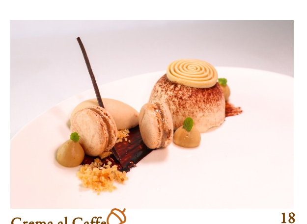
Crema al Caffe Cold Espresso Coffee with Whipped Cream, Coffee Lime Macaron, Coffee Anglaise