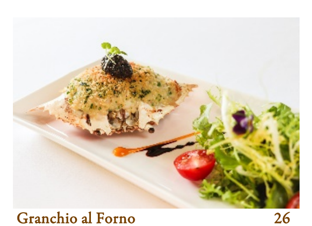
Baked Crab, House Salad