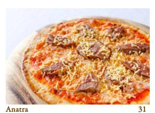
Duck Confit, Porcini, Scarmoza