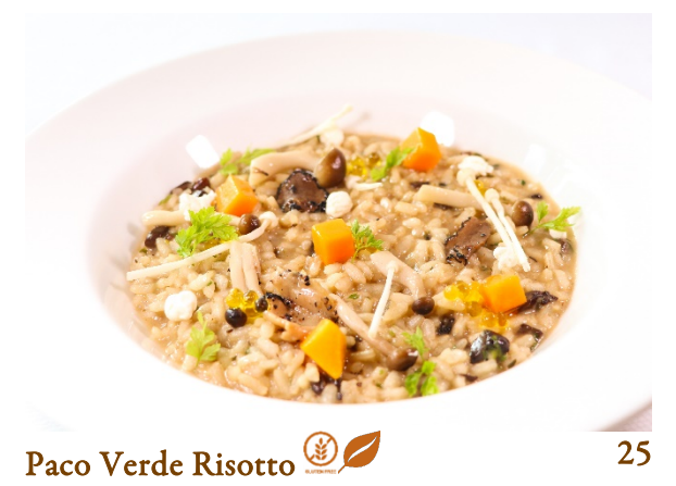
Buttered Portobello & Mushrooms, Mascarpone Cheese, Confit Pumpkin, Creamy Tomato Jus