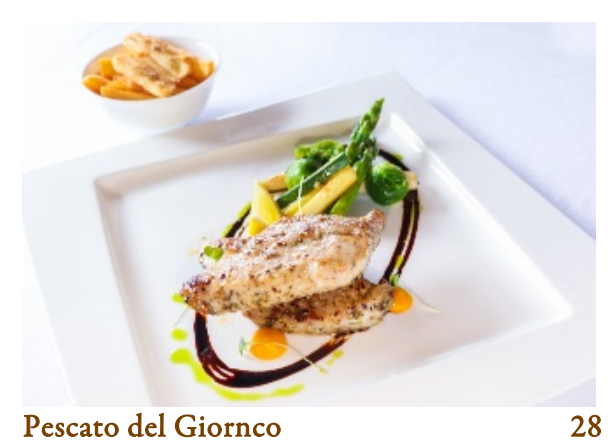
Maldivian Tuna, Garden Vegetables, Truffle Fries, Lemon & Orange Emulsion