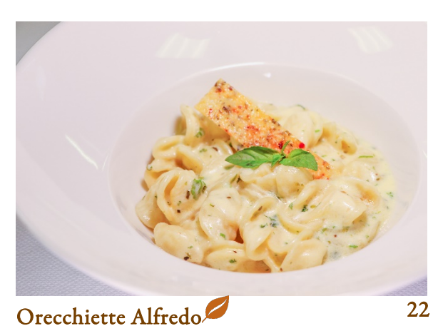
Cheese, Butter, Cream, Basil Oil Trickle, Fresh Basil