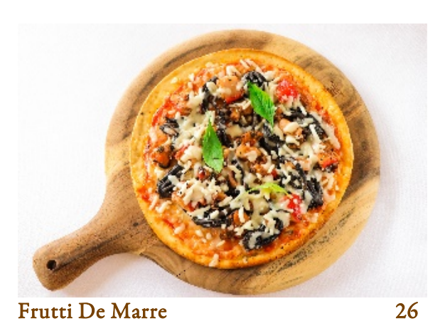
Mixed Seafood, Squid Ink, Fresh Basil