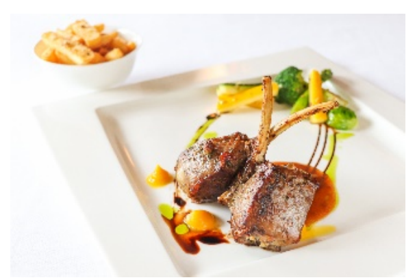
Costolette d' Agnello 32 Garlic Lamb Rack, Garden Vegetables, Truffle Fries, Wine Jus