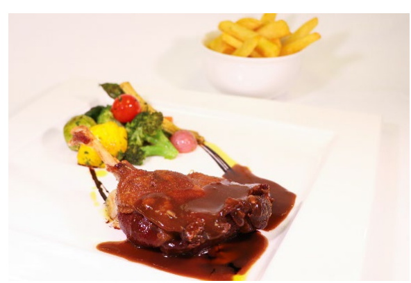
Petto d'Anatra 33 Confit Duck Leg, Grilled Vegetables, Truffle Fries, Cherry Wine Jus