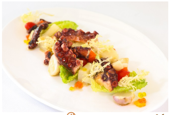
Red Wine Poached Octopus, Confit Root Vegetables, Assorted Fresh Greens, Scamorza, Mustard & Passionfruit Dressing