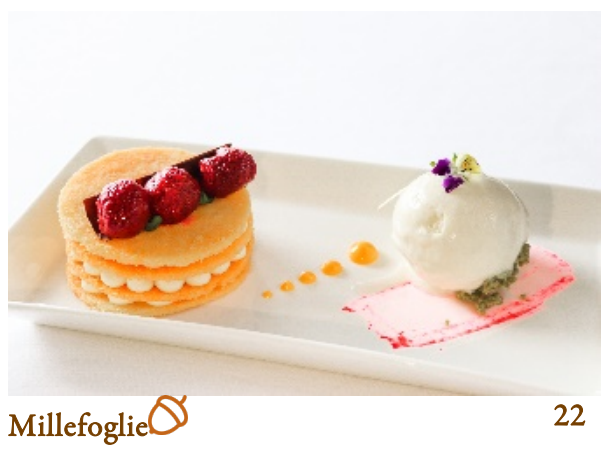
Ginger & Fennel Ice Cream, White Chocolate Mousse