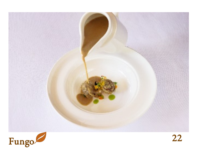
Truffle Oil, Stuffed Mushroom Fritters, Basil Oil Trickle