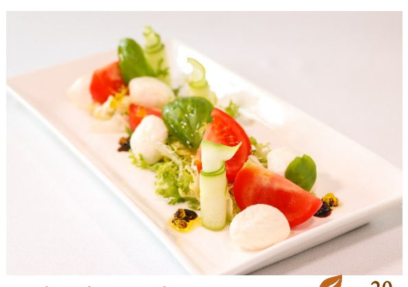
Insalata di Pomodori-e-Bocconcini Bocconcini, Tomato, Oil Caviar, Aged Balsamic Trickle, Fresh Basil