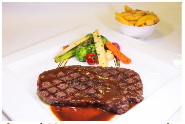
Costata di Manzo 69 Beef Ribeye, Grilled Vegetables, Truffle Fries, Wine Jus