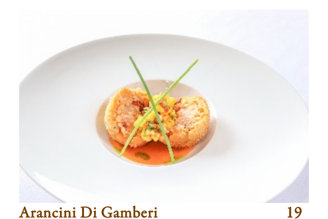
Sun-Dried Tomato, Butter Tossed Prawn, Creamy Lobster Butter Emulsion, Lemon, Chilli & Mango Salad, Basil Oil Trickle