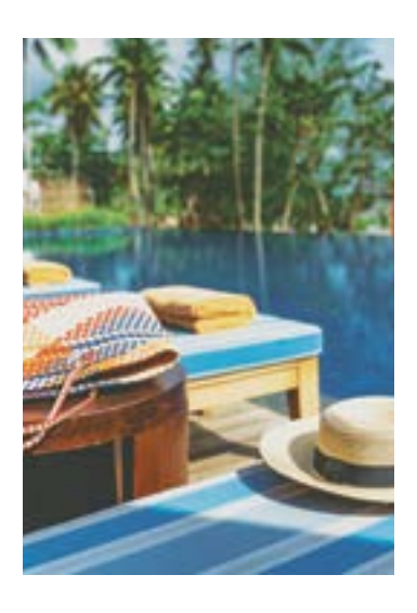
Plunge Into Tranquillity

Bask in the sun by a shimmering infinity pool. Take a swim in quietude, as the soothing sounds of the waves lull you into a state of relaxation.