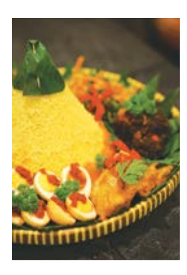
Savour Decadent Food

Feed your soul with gourmet plates from top-tier restaurants, ranging from tastes of the Indonesian Archipelago to perfected flavours of the world.