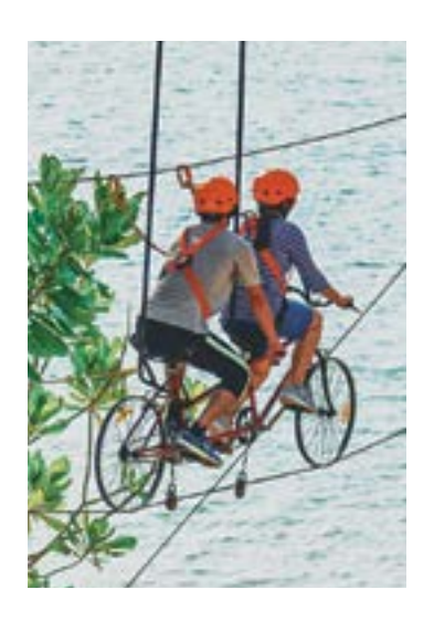
Team-Building With A Twist

In this peaceful haven, business becomes blissful. Change the scenery of your corporate gatherings with a meeting by the beach, or bring everyone closer together with an assortment of team-building activities.