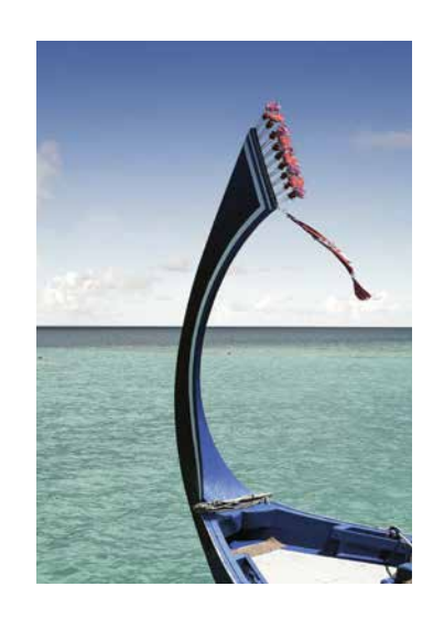
- Receive and be received, the Maldivian way ———

Bright, bold, beautiful. The spirit of the Maldives shapes every smile and greets you "maruhabaa".