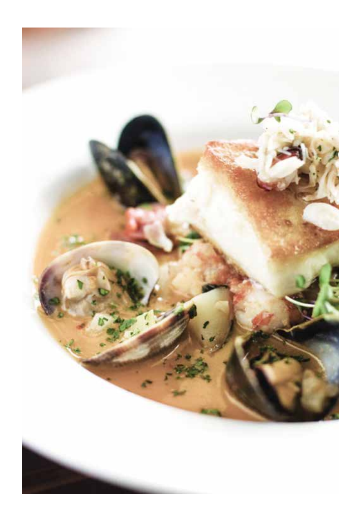
A culinary voyage of the senses

Journey through the sensory combination of fine cuisines and magnificent views. Authentic and traditional, refined and contemporary, intimate and inviting - whichever epicurean experience you wish - the choice is yours.